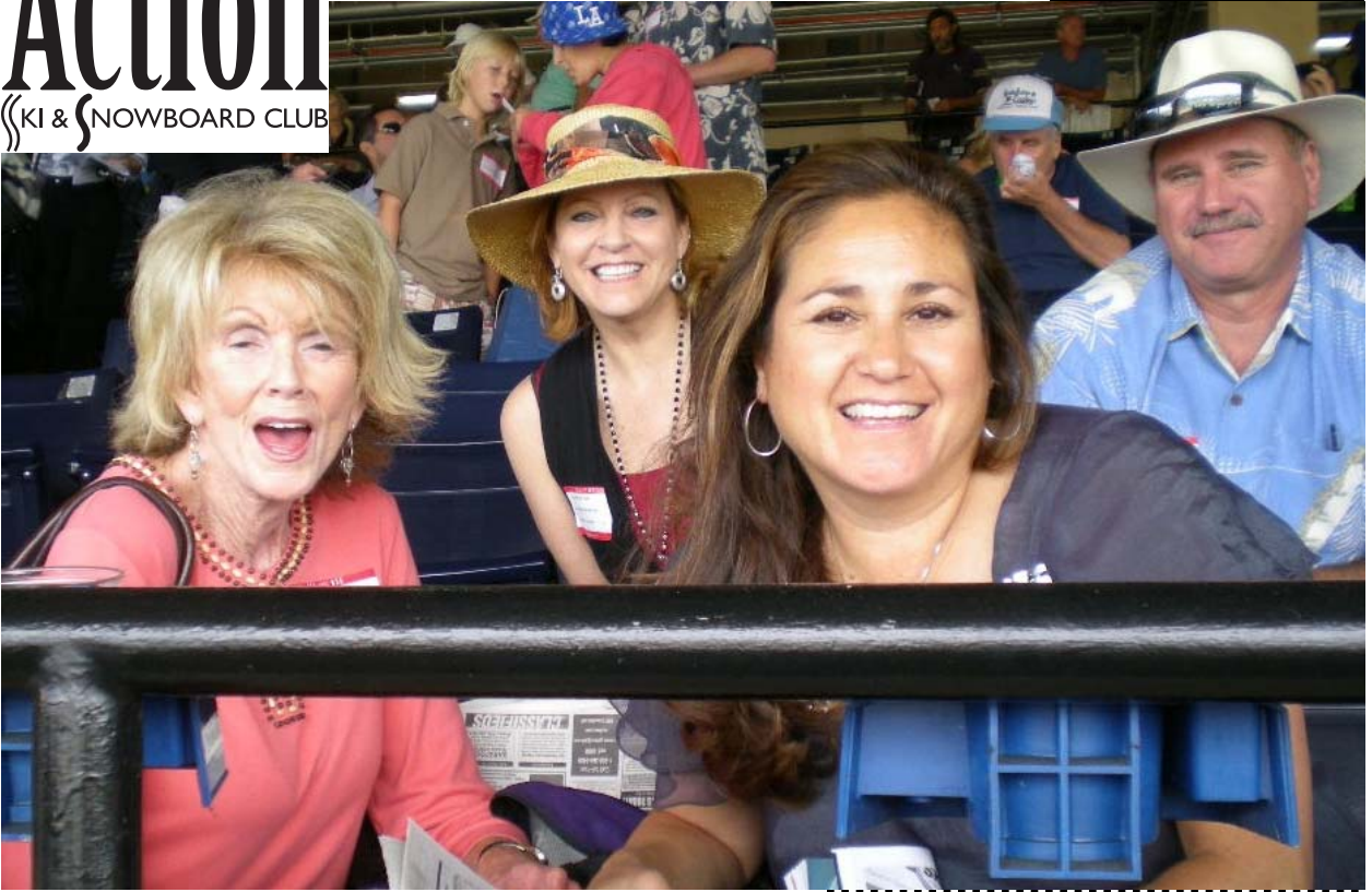
Actioneers at the Del Mar races August 14, 2010